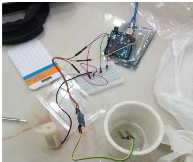
Figure 1: Automatic Plant Watering System on operation for demonstration

Figure shows the experimental setup of the project. When a family goes on vacations, there will be no one to water the plants every day at home. Each plant needs water to survive. Therefore to solve watering issues to plant, an engineering project titled “Plant Watering System Using Arduino Uno” is proposed here. Moisture sensors are used to sense the moisture level of the soil and complete the action watering with help of programming in Arduino Uno. Arduino Uno is used as it has all the features that are needed for this project and the moisture sensor is used as it has more reliability than timer circuit. If soil gets dry, then sensor senses low moisture level and automatically switches ON the water pump to supply water to the plant with help of a signal from Arduino. As plant get sufficient water and soil gets moist, then the sensor senses enough moisture in the soil, after which the water pump will automatically stop. Water level sensors are also used to sense the level of the water tank. The system configuration of Automatic Plant Watering System is shown in fig.1